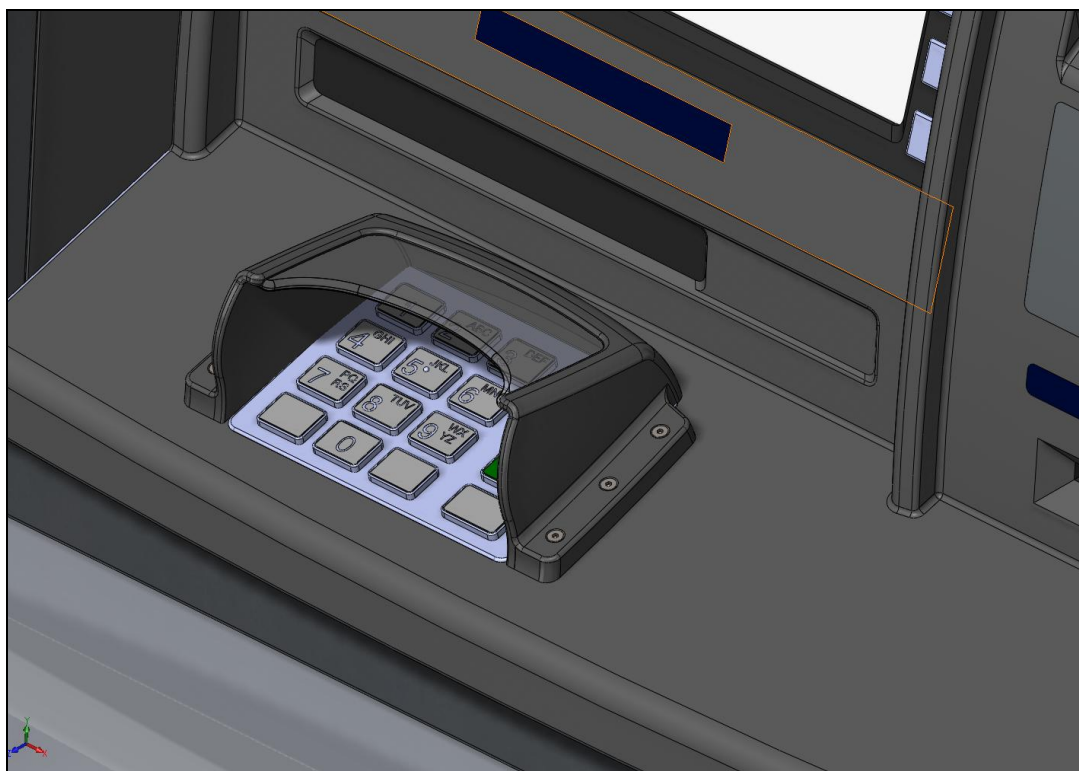
Figure above: PINGuard for NCR ATM.

PIN Guard was designed that when viewed from above, the customer has a clear view of the PIN pad. If viewed from a certain angle the view becomes opaque. This allowed the design of the PINGuard to be low aspect but not interfere with ATM's functionality. With aesthetics in mind, it has also been designed to complement the ATM fascia with its sleek profile and high quality stainless steel and polymer finishes.