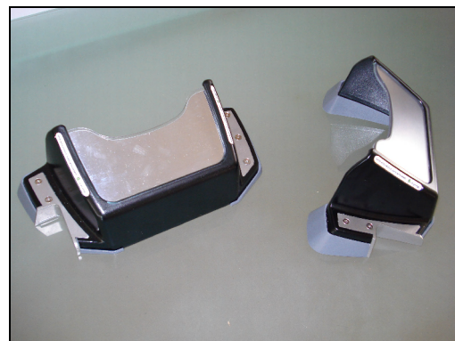
Figures above: PINGuard for Diebold ix range of ATMs. Note cutout for audio headphone jack.